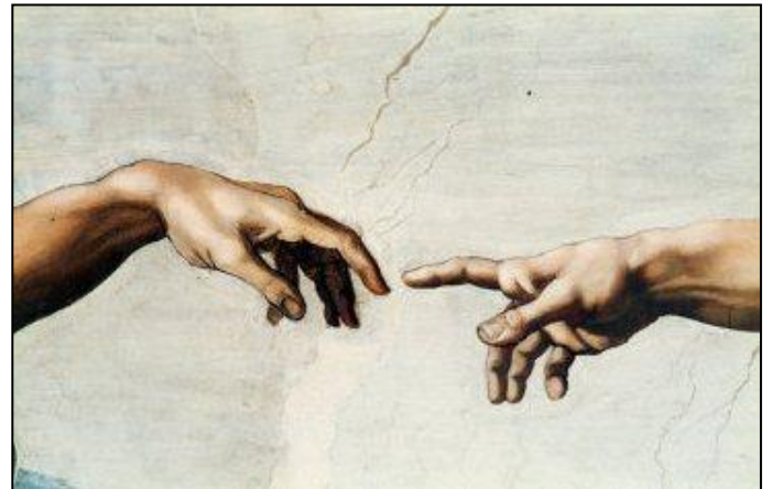
Michaelangelo - God Creates Man - Sistine Chapel, Rome, Italy

My prayer is that this Lenten Season will be a transformational time for all of us and a time of revelation. It should not be so much about changes we make but rather a discovery, or rediscovery of what was always there and true, our Christ-selves.